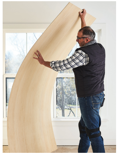
Flex and Look Test