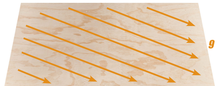
Fastening Diagram 9