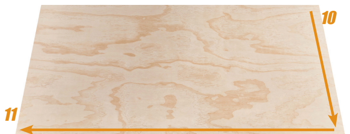
Fastening Diagram 10, 11