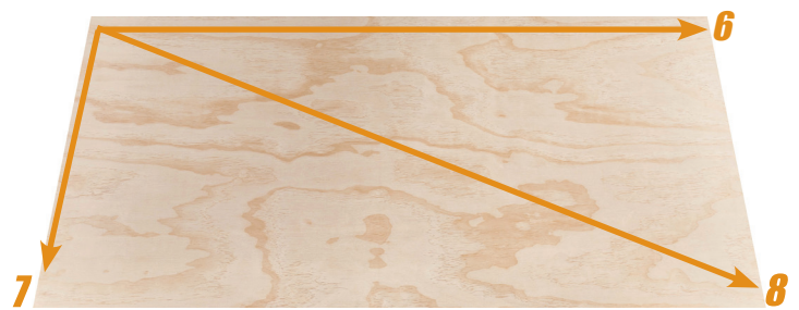
Fastening Diagram 6, 7, 8