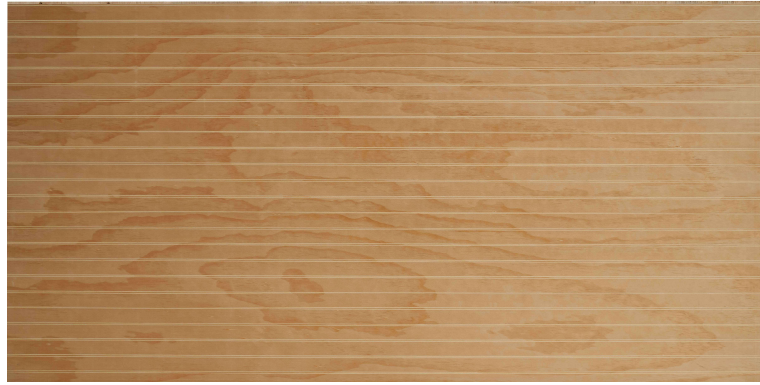
2" V-Bead pattern clear Pine stain grade face - free of patches