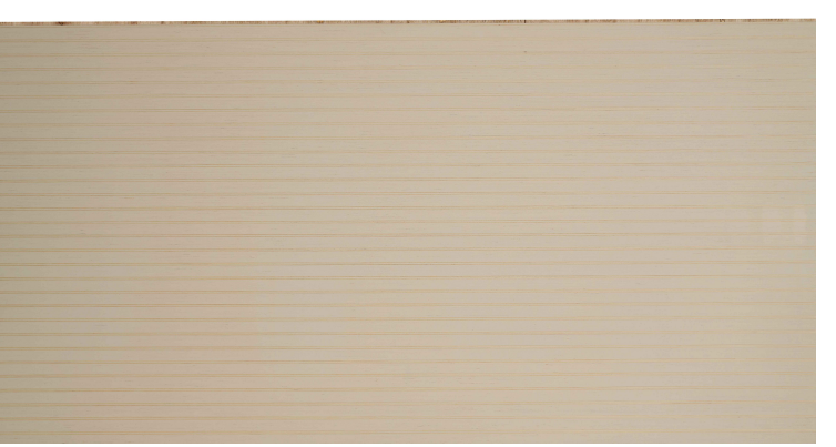
1.6" V-Bead pattern on the reverse side, primed and ready to use