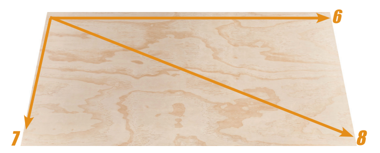
Fastening Diagram 6, 7, 8