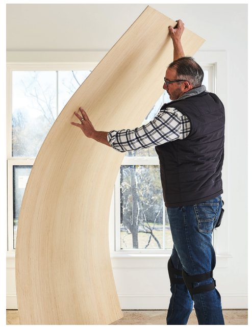
Flex and Look Test

4. With the panel in this flexed position, thoroughly inspect the entire panel surface for imperfections, which will look like "bubbles" or "creases". In the rare instance you find such an imperfection, do not use the panel. Set it aside and contact Patriot Timber Products immediately for a resolution.