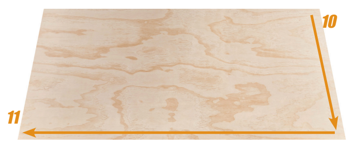
Fastening Diagram 10, 11